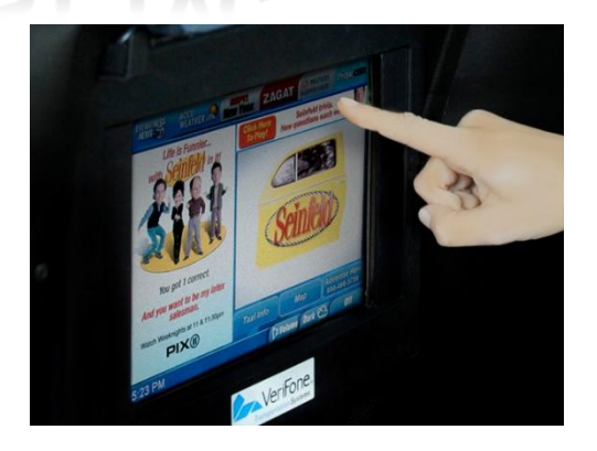
Screen Size 8 inches

Each Ad runs 35 seconds on a video "Theater" that runs 18 to 24 minutes. This is the same as the average taxi ride so each passenger will see the loop through once. And "Icon" buttons that call up the interactive programs on the screen.